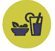
Table service restaurants